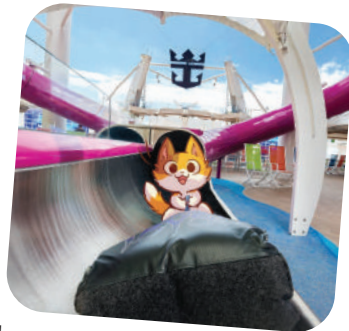
She raced down fun slides.

She even got a better score than her dad at miniature golf. All this on a ship!